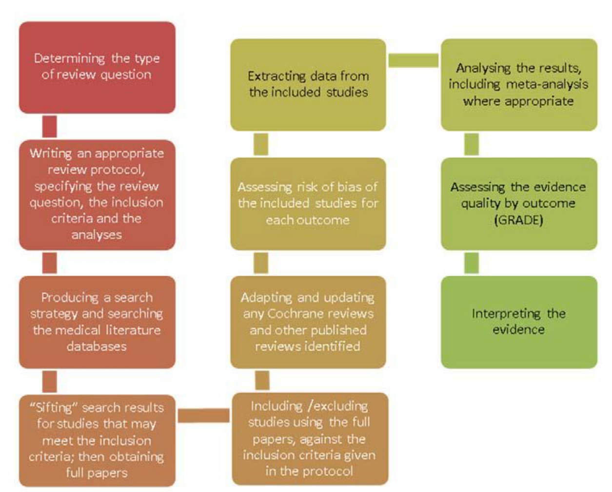
Figure 2: Step-by-step process of review of evidence in the guideline