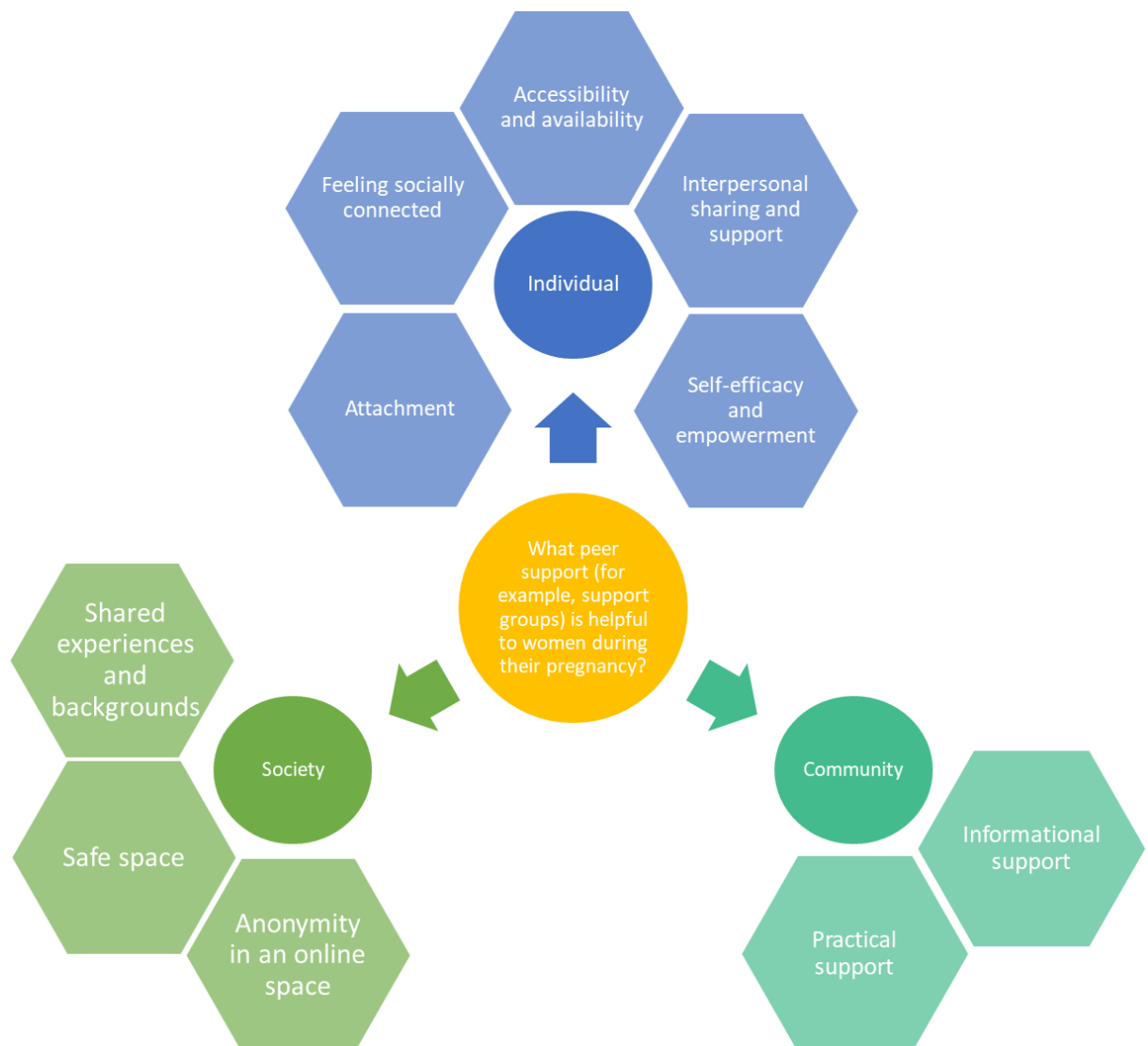
10 Figure 1: Theme map for peer support

7 The evidence was categorised into 5 levels using Bronfenbrenner's socioecological model 8 (Bronfenbrenner 1979). Framework analysis was used to identify themes, presented as a 9 theme map in Figure 1. For further details about the methods, see Supplement 1: methods.