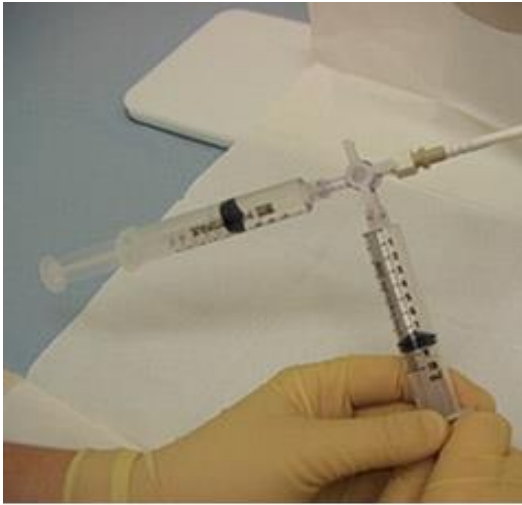
Figure 1: Tap open to empty syringe

In Figure 1 the Urokinase filled syringe is on the left, and the empty syringe, on the right, is drawn back to create a vacuum. Please note the syringe in picture shows 5ml liquid, 1ml only is needed for PICC lines.