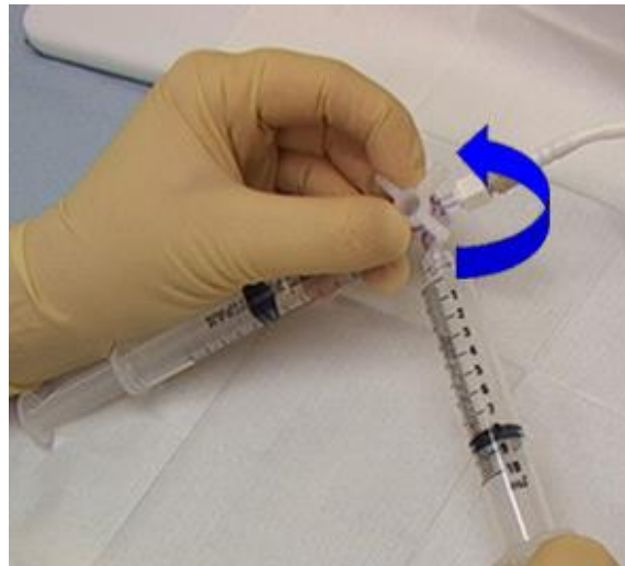
Figure 2: Turning tap to open Urokinase filled syringe

In figure 2 the Urokinase filled syringe is on the left, and the empty syringe on the right. Please note the syringe in picture shows 5ml liquid, 1ml only is needed for PICC lines.