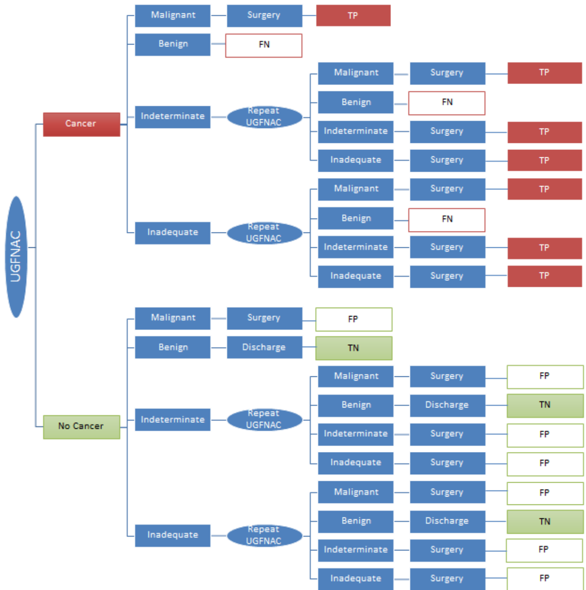
Figure 1: UGFNAC without benign repeat