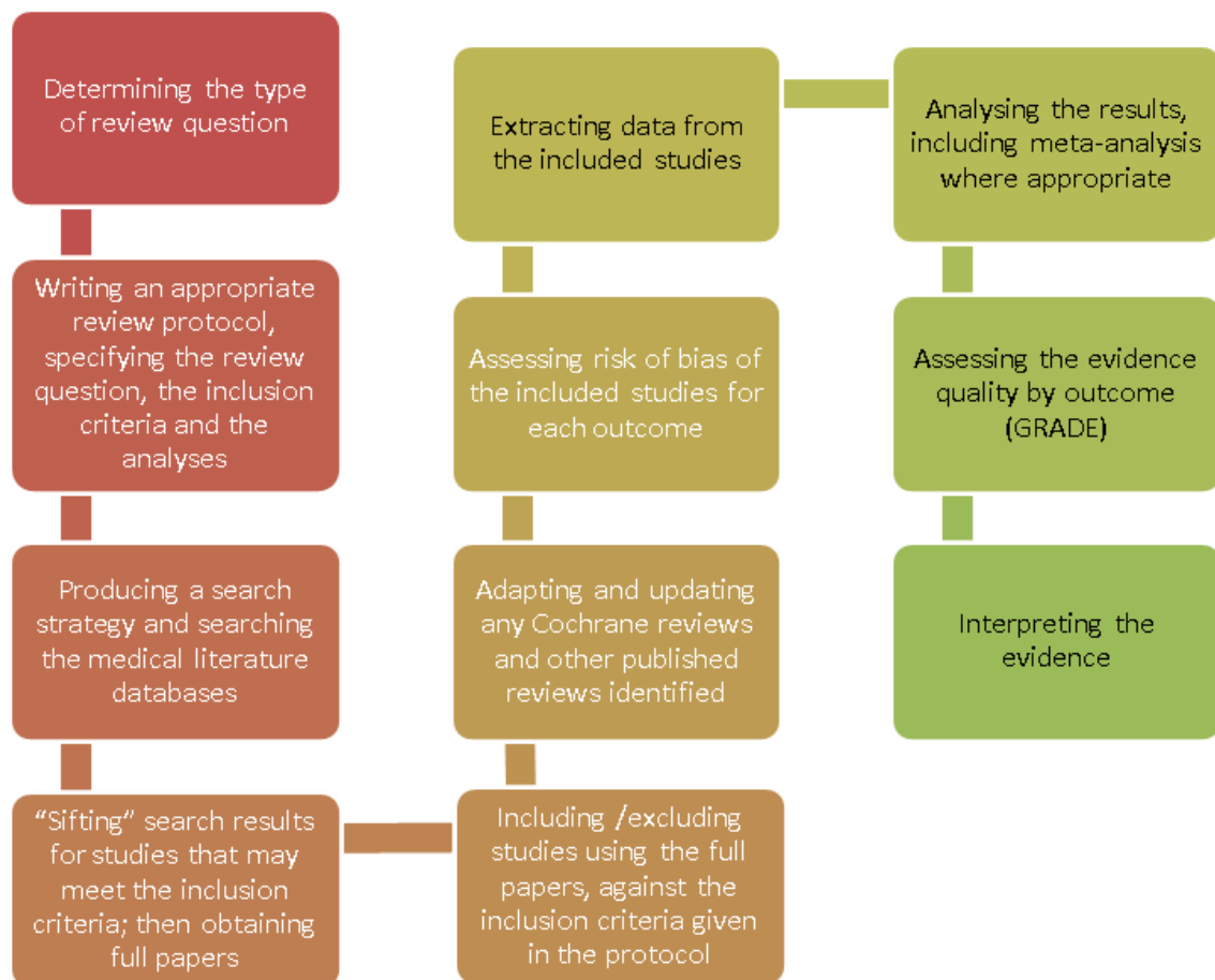
Figure 1: Step-by-step process of review of evidence in the guideline

Sections 2.1 to 2.3 describe the process used to identify and review clinical evidence (summarised in Figure 1), sections 2.2 and 2.4 describe the process used to identify and review the health economic evidence, and section 2.5 describes the process used to develop recommendations.