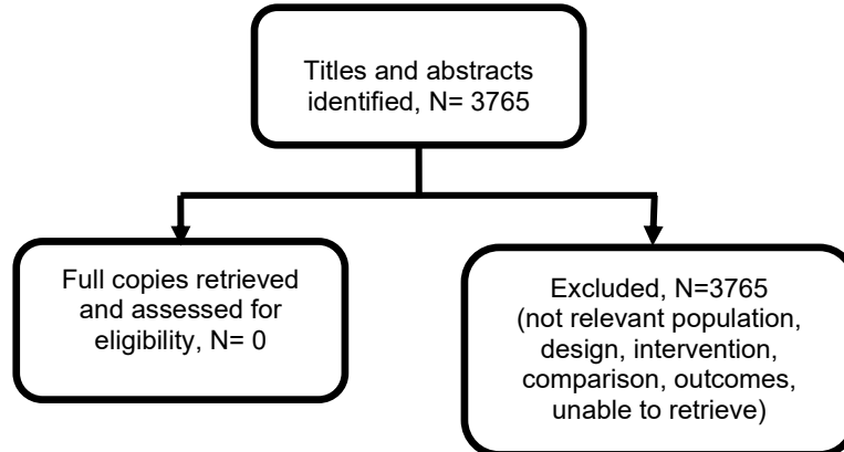
Figure 2: Study selection flow chart

5 No economic evidence was identified which was applicable to this review question.