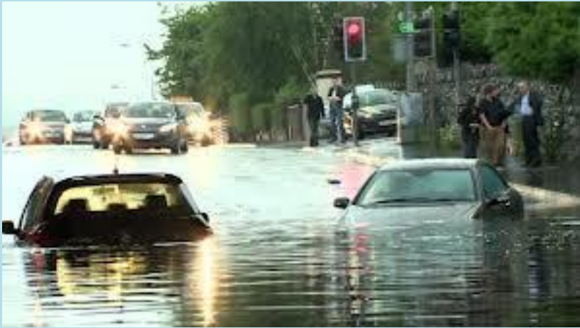
Belfast, June 2012