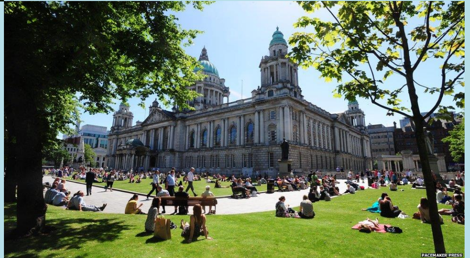
Belfast, June 2013