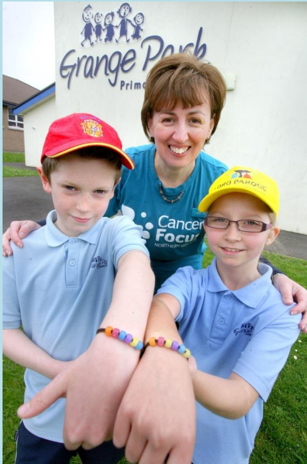
Sun safe school sports day