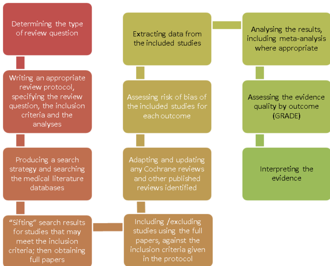
Figure 1: Step-by-step process of review of evidence in the guideline

5 Sections 4.1 to 4.3 describe the process used to identify and review clinical evidence (summarised in 6 Figure 1), sections 4.2 and 4.4 describe the process used to identify and review the health economic 7 evidence, and section 4.5 describes the process used to develop recommendations.